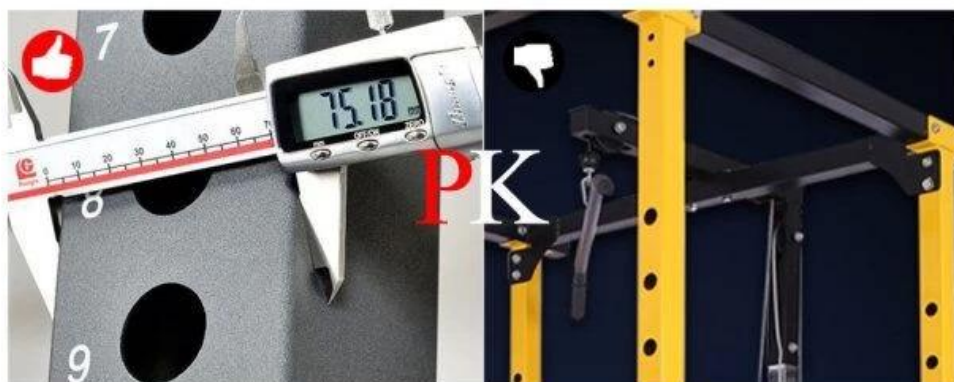
Column specification 80*80*3mm 75*75*3mm 65*65*2mm 60*60*2mm