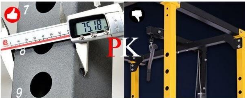
Column specification 80*80*3mm 75*75*3mm 65*65*2mm 60*60*2mm