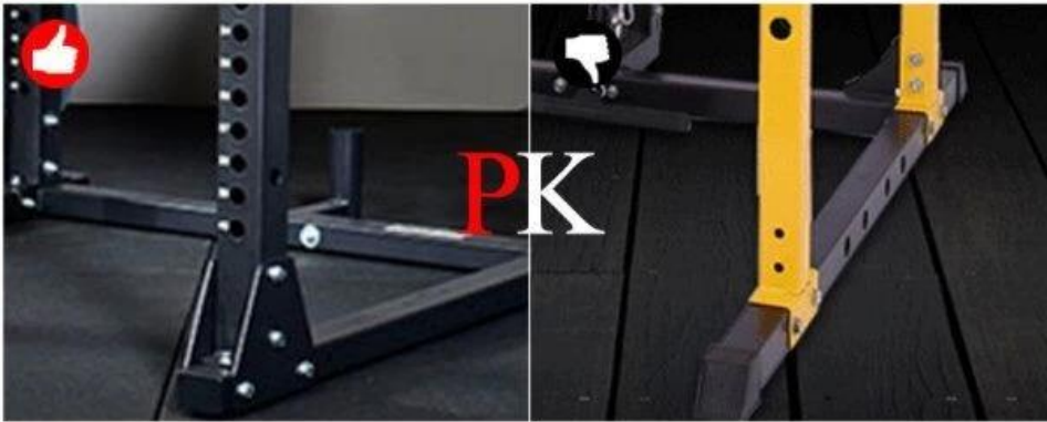
The triangle is fixed, and the structure is more stable and firm