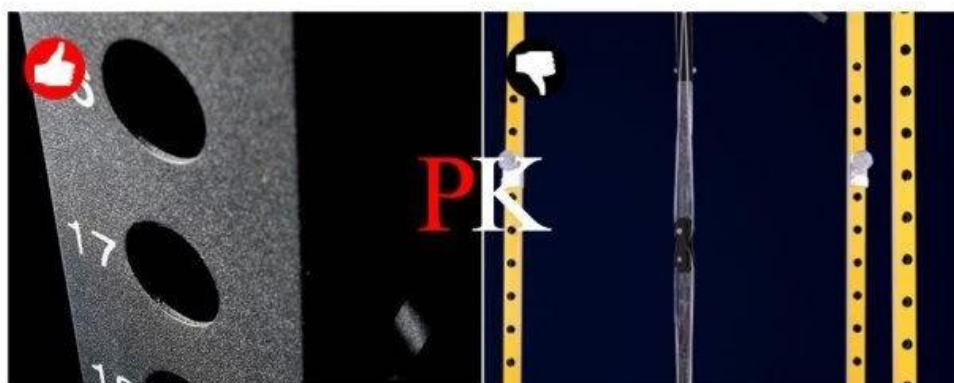
Tight hole to meet a variety of needs