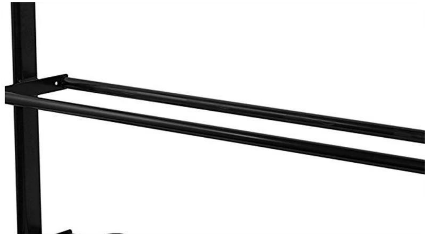
The medicine storage rack