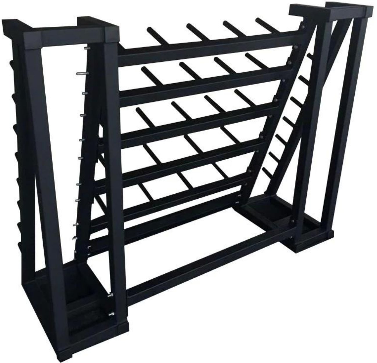
The back of this body pump set storage rack