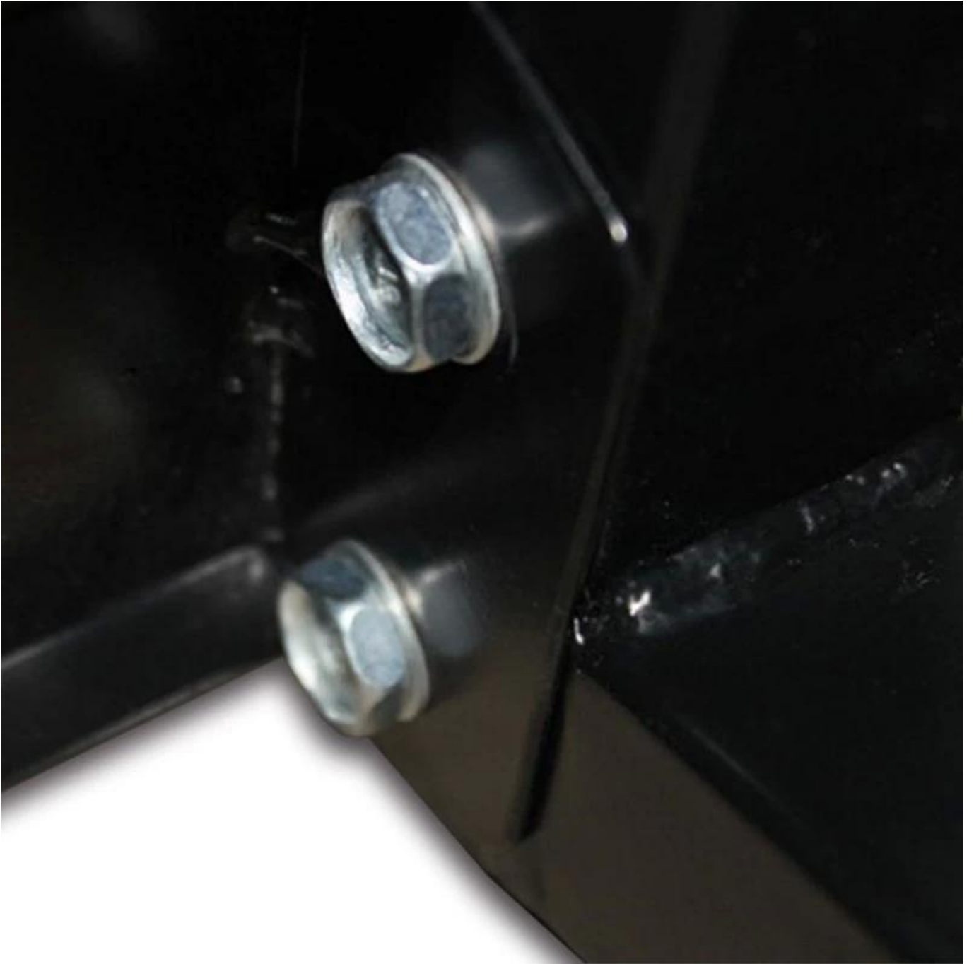
The screw fixes the rack steadily .