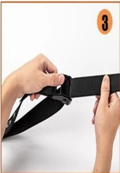
3. Strap starts from the bottom metal and through the metal