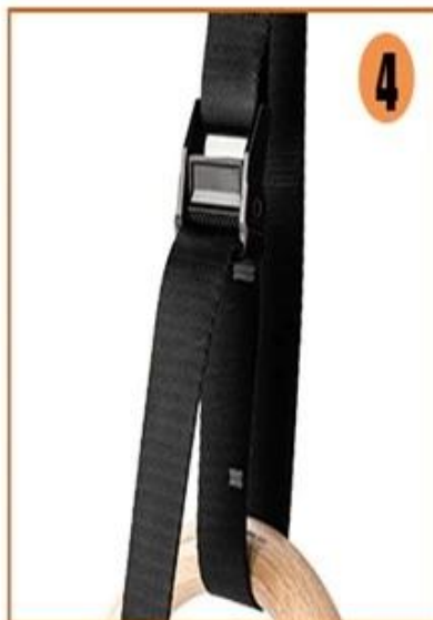
4. The force point is on the bottom metal of the buckle