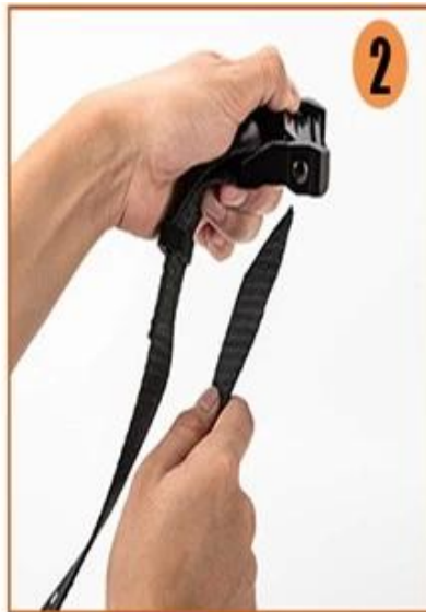
2. prepare the buckle and strap