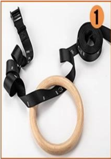
1. Feed the strap through the ring