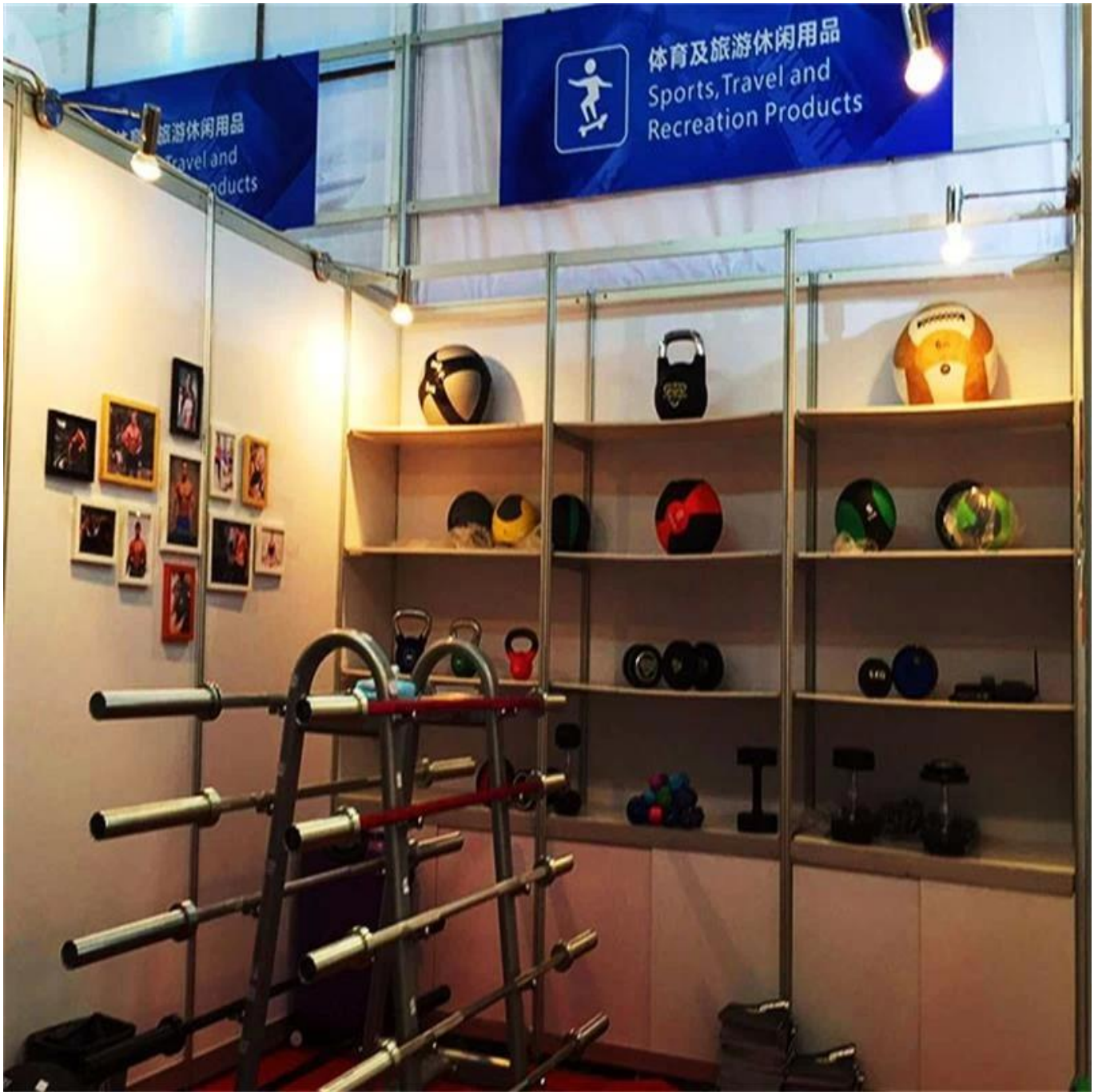
Picture With Customers