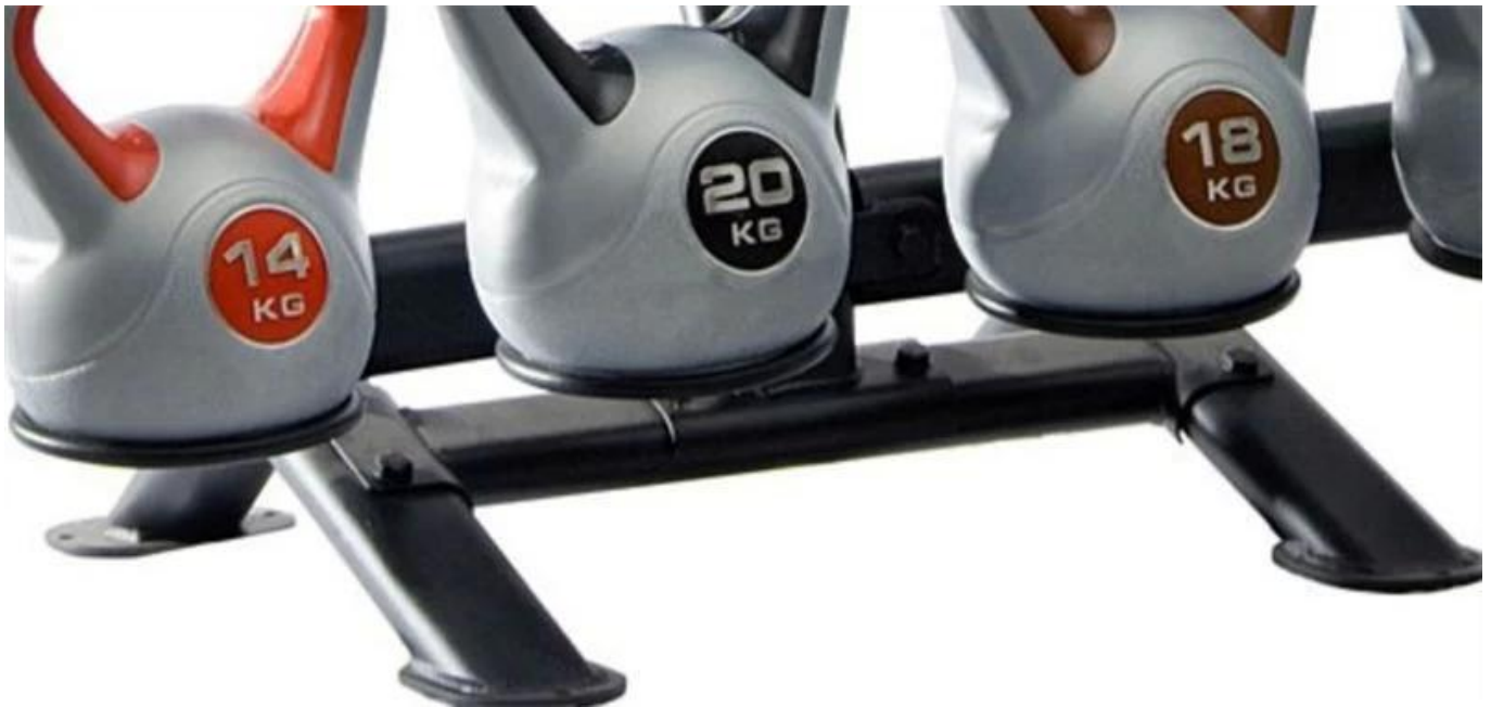
The strong base of storage rack