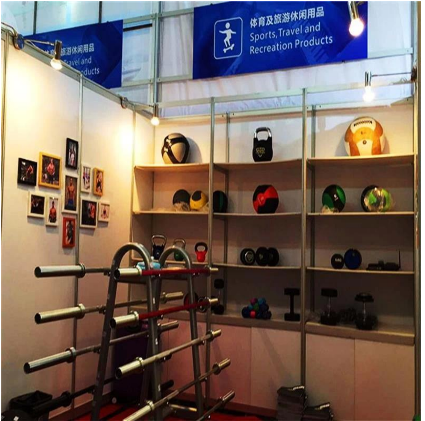
Image with customers