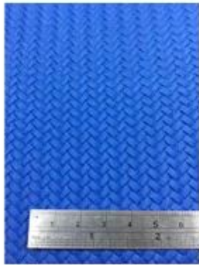
Hemp rope Texture