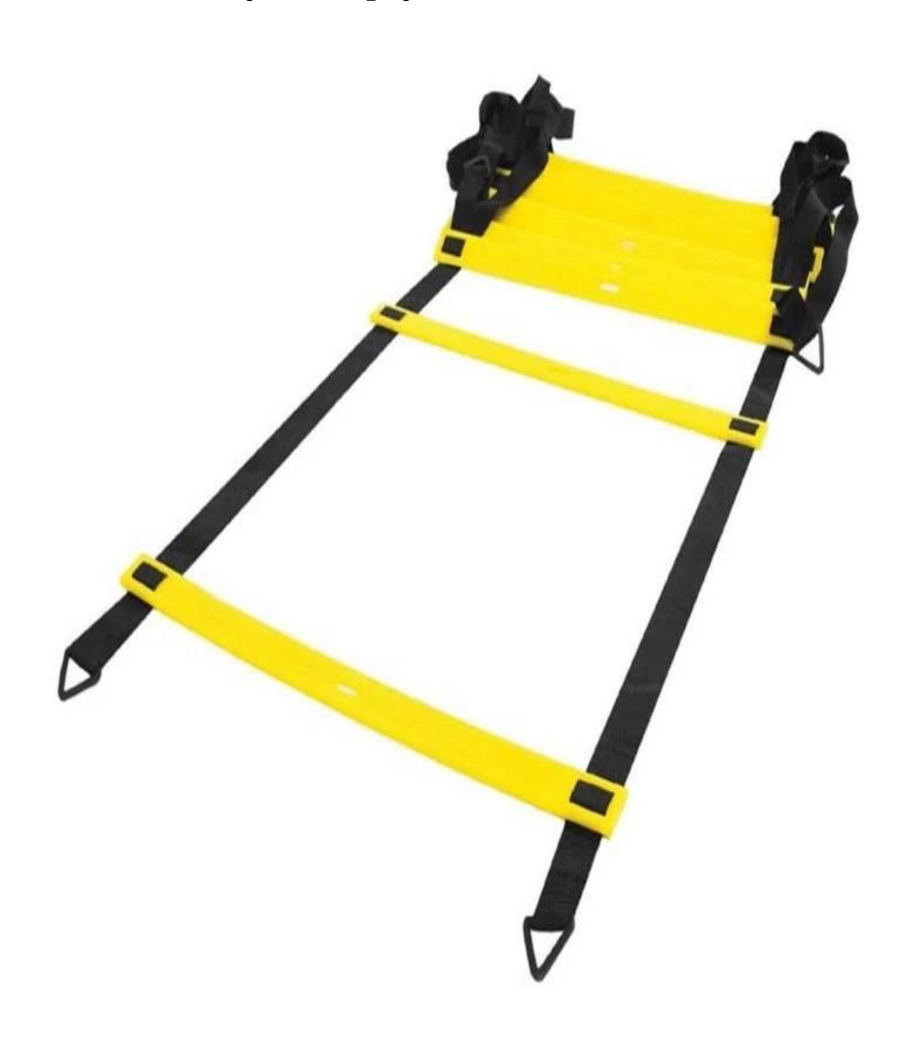
Delivery Detail: Within 27 days after payment