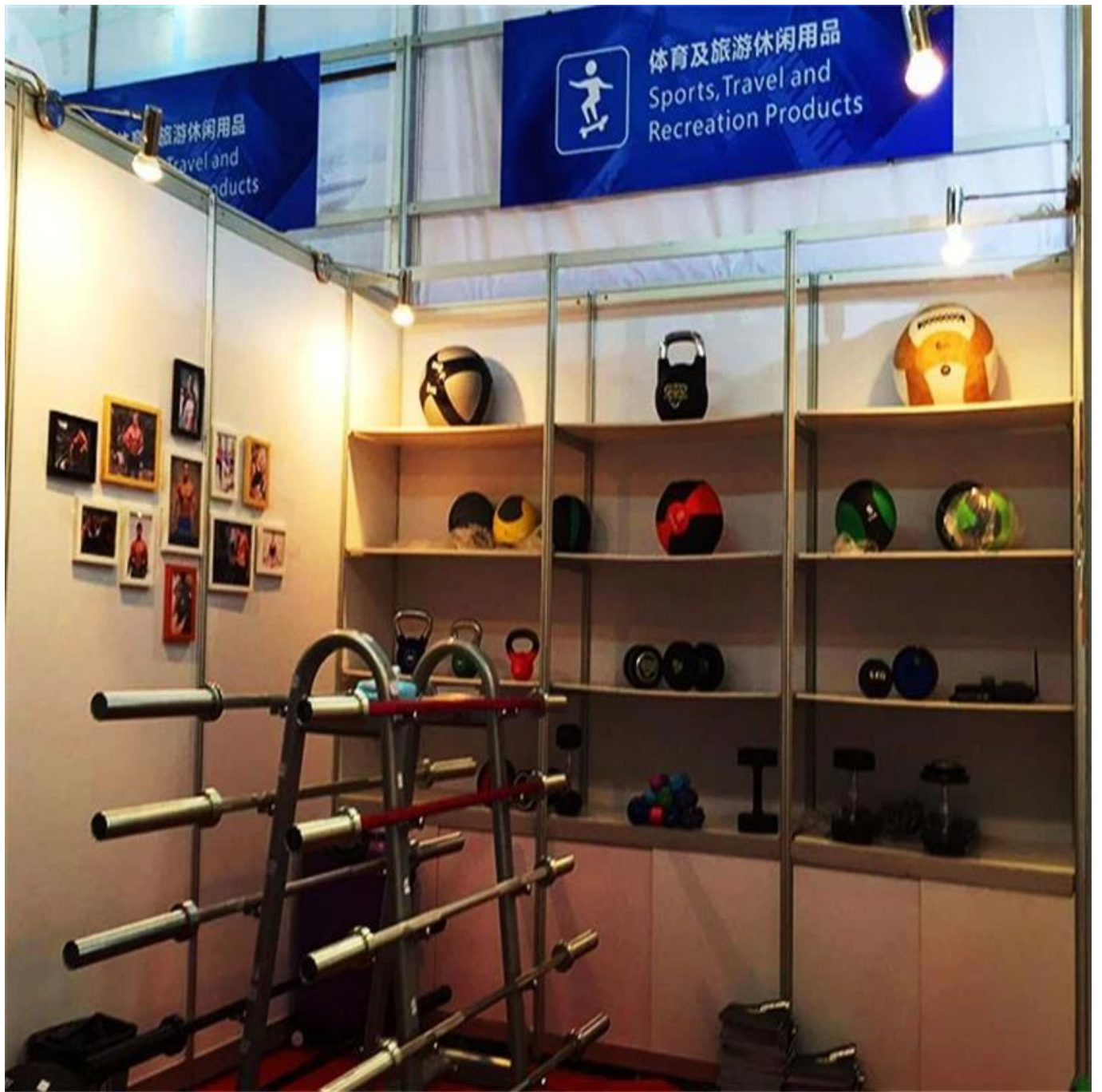
Picture with customers