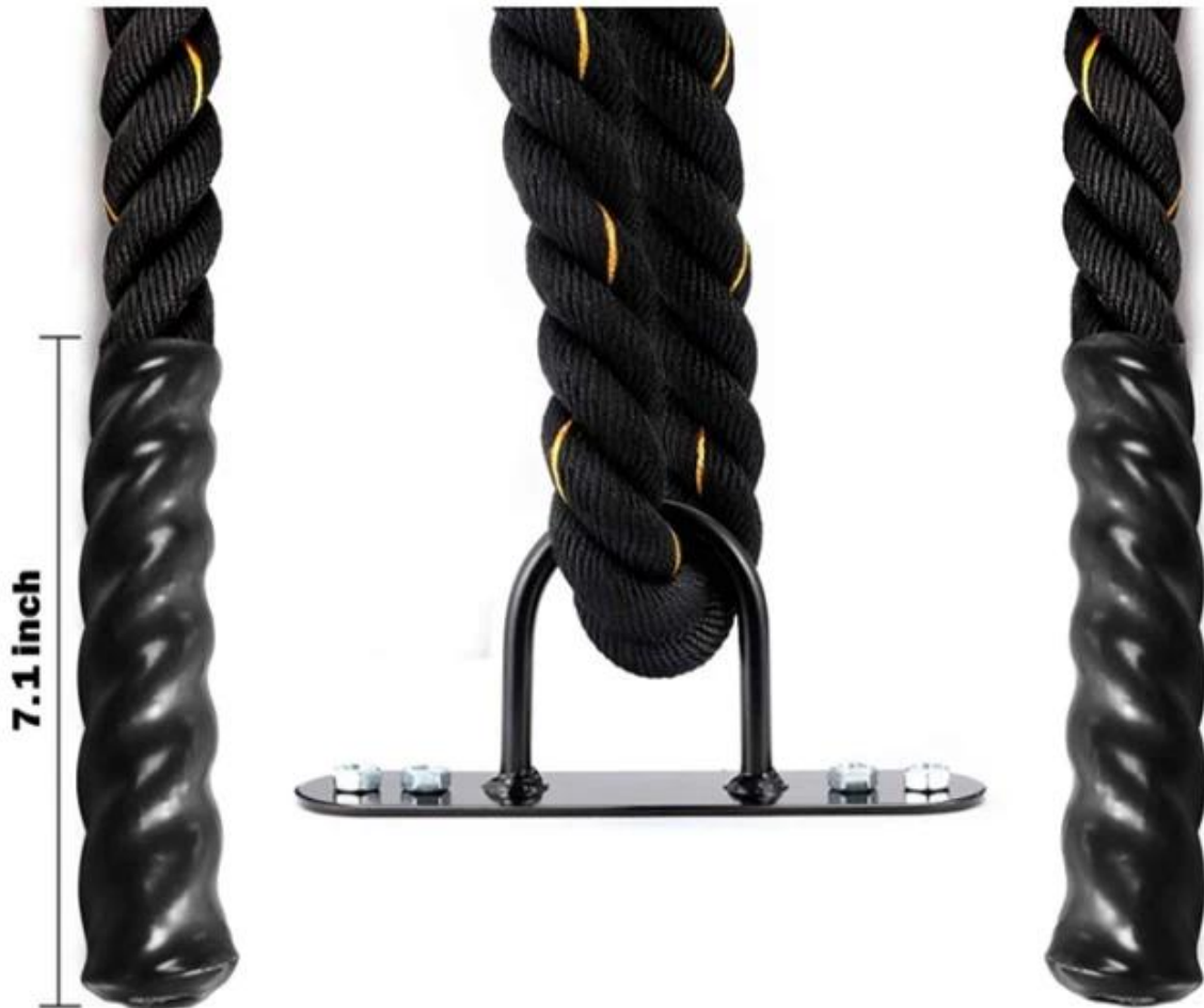
1.5 inch 30ft Length Workout Rope