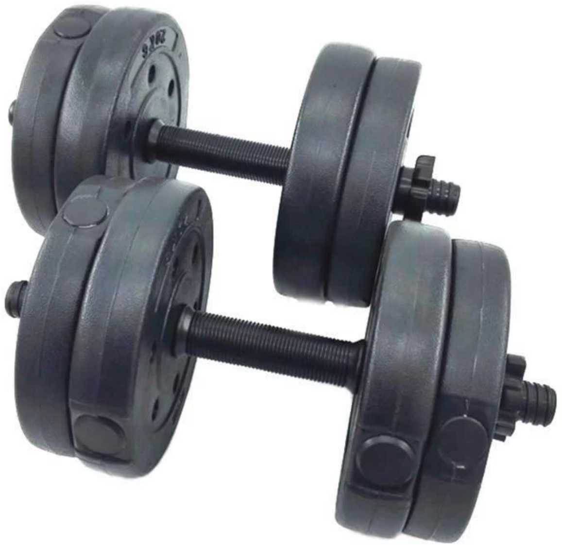
15 kg cement dumbbell combination