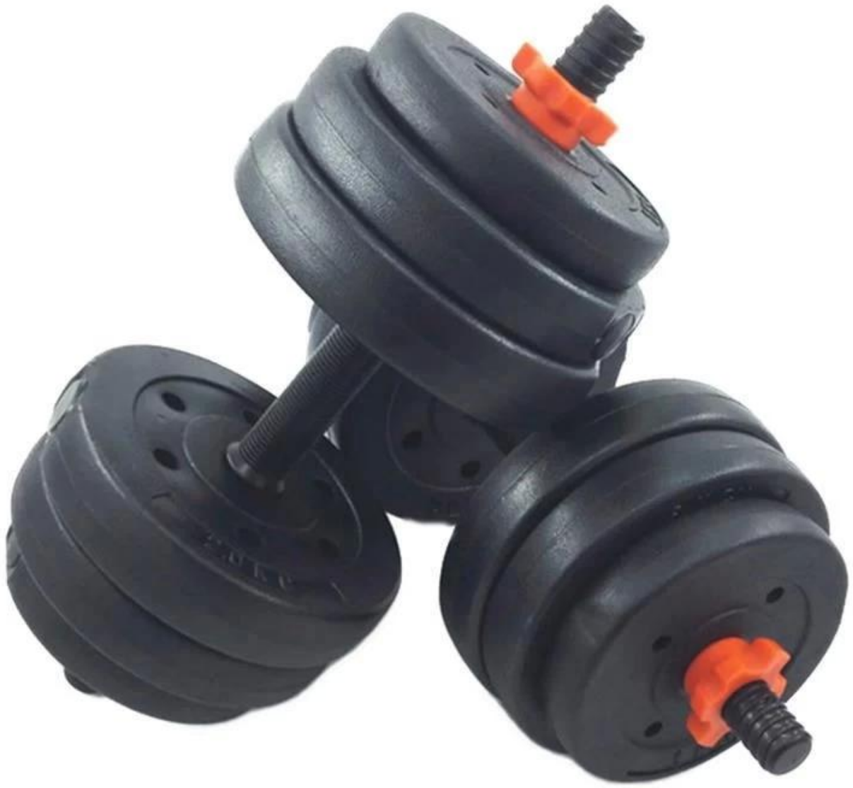
20 kg cement dumbbell combination