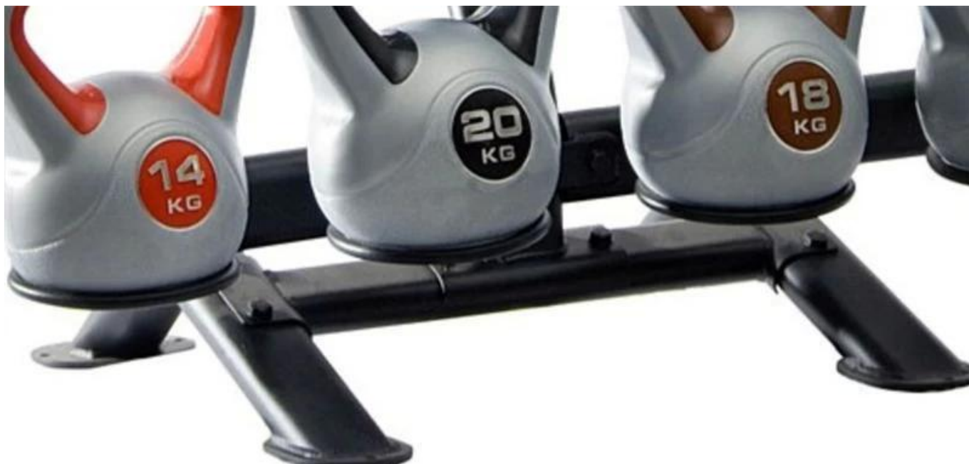
The strong base of storage rack