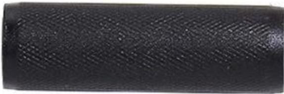
The non slip dumbbell handle