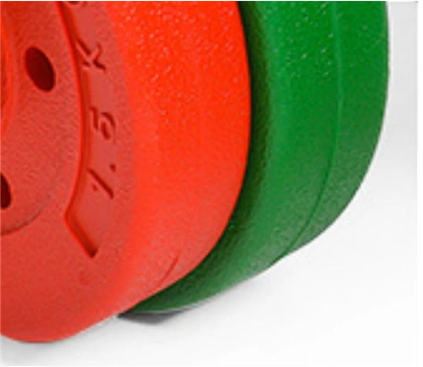
The environmental protection material