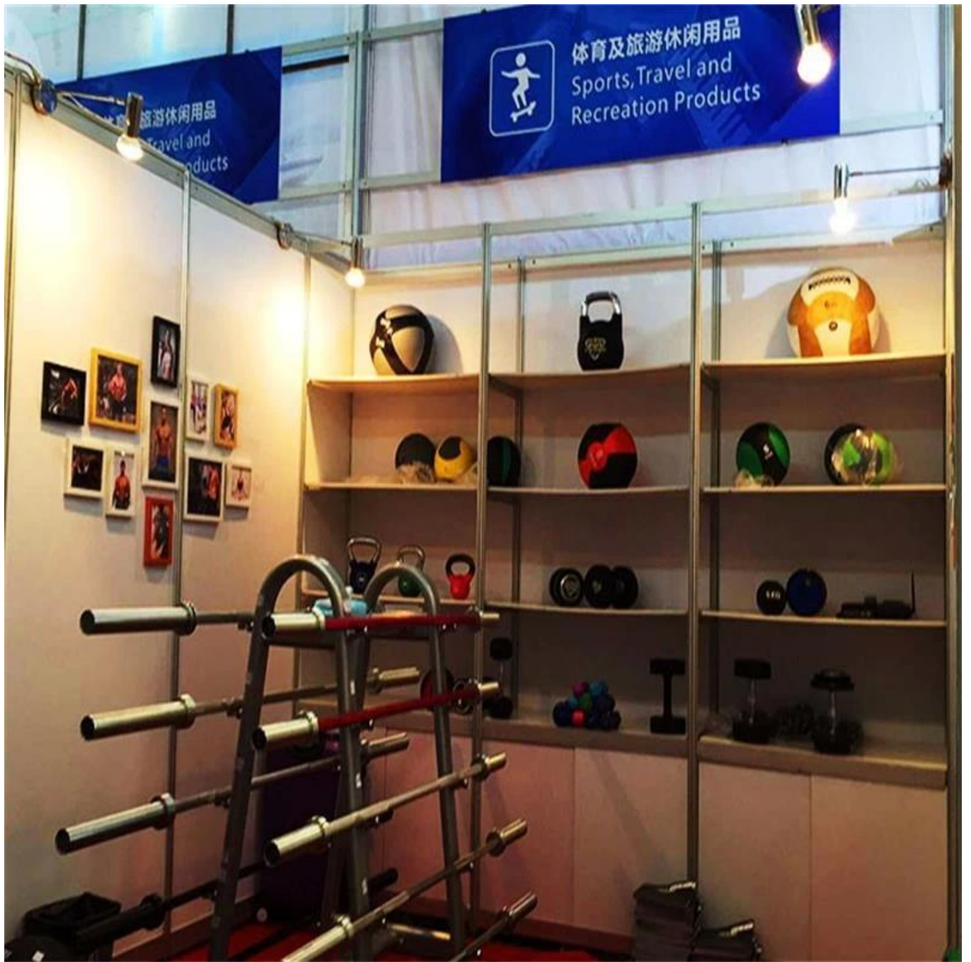
Image with customers