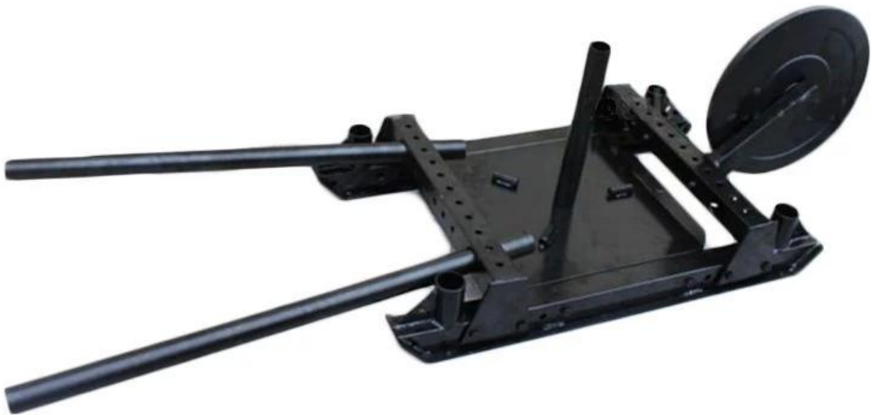
The wheel barrow attachment on the back of sled