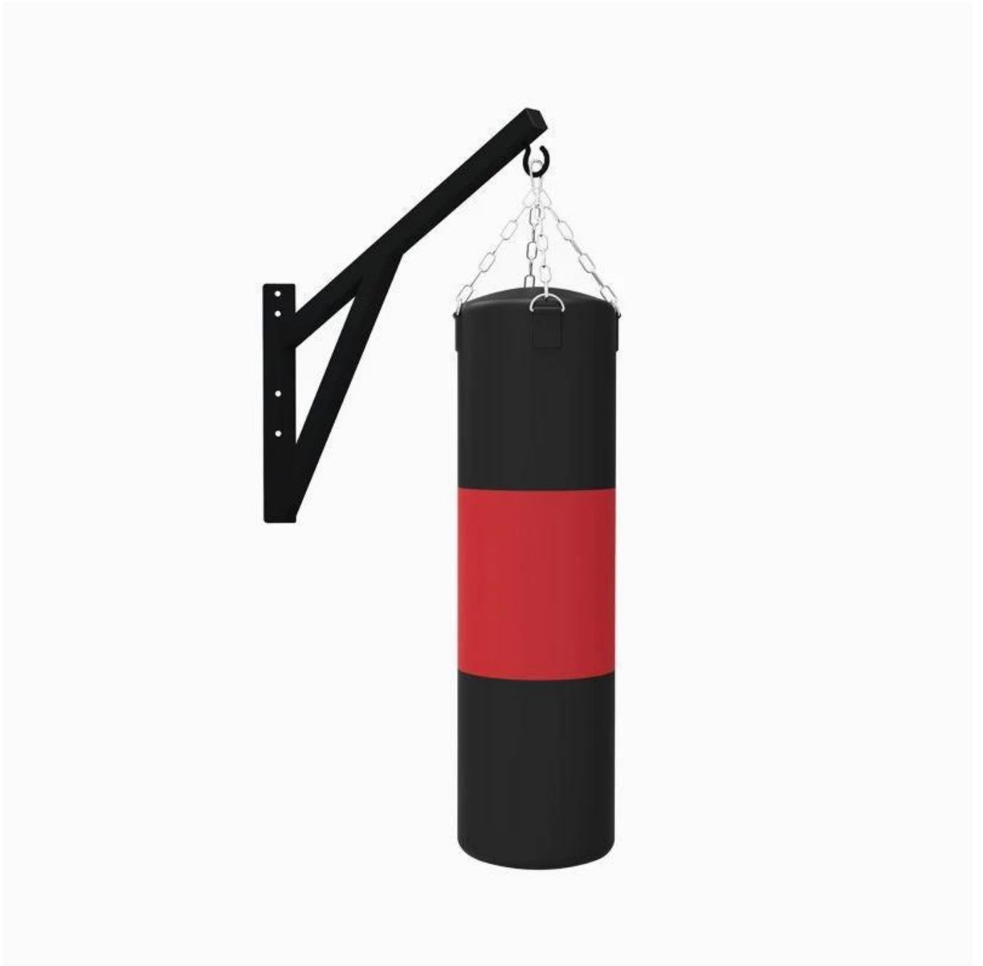
1. Solid Suspension Chain