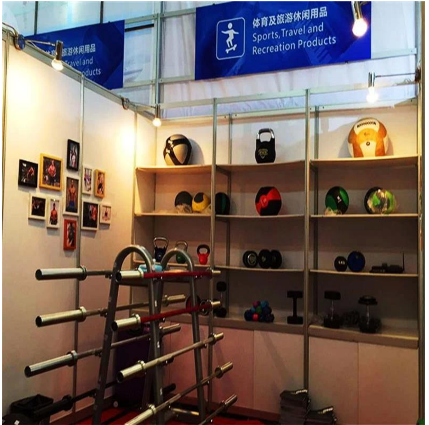
Picture with customers