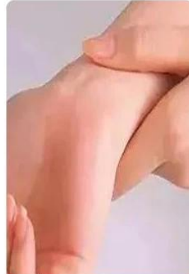
tendon sheath damage

Fashion color matching, enrich your choice