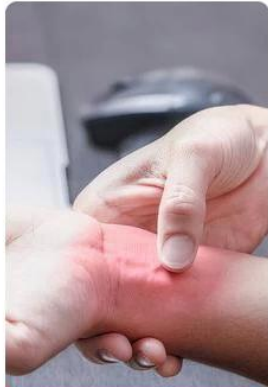
Repetitive Strain Injuries