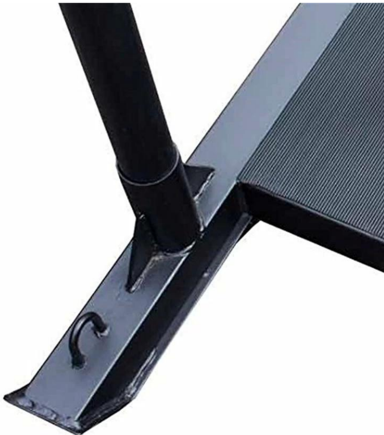
The hole on the sled skis