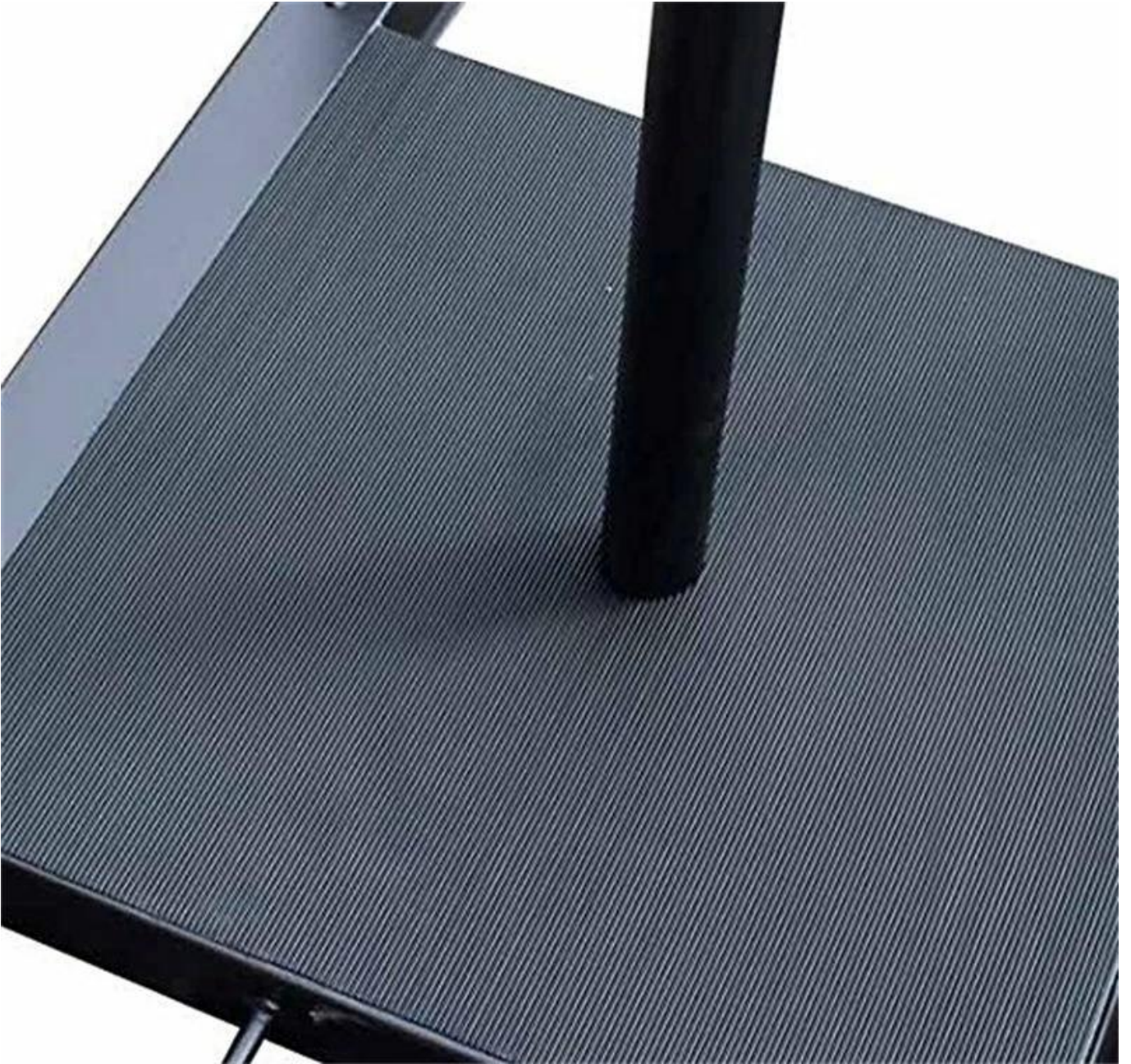
The precision of the ski