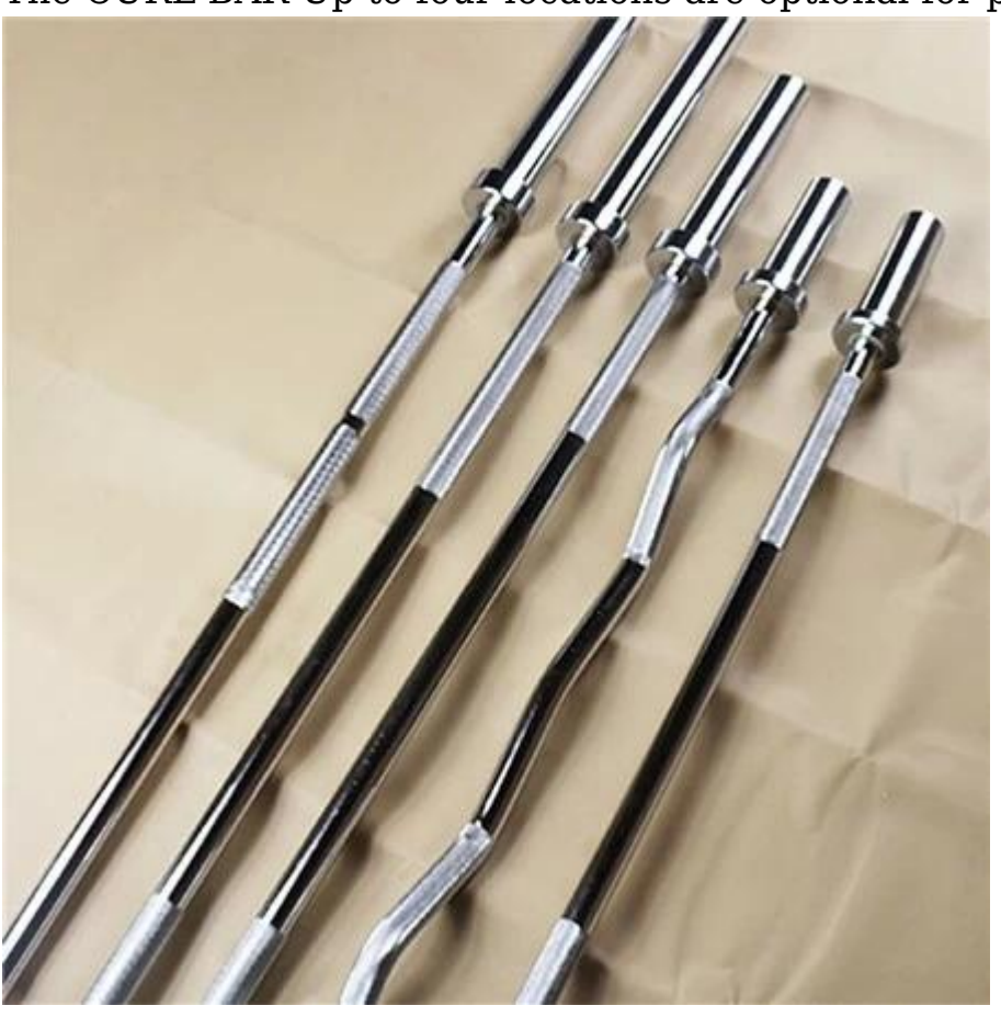
The detail of the ez \underline{\text{CURL BAR}} The CURL BAR Up to four locations are optional for placing logo