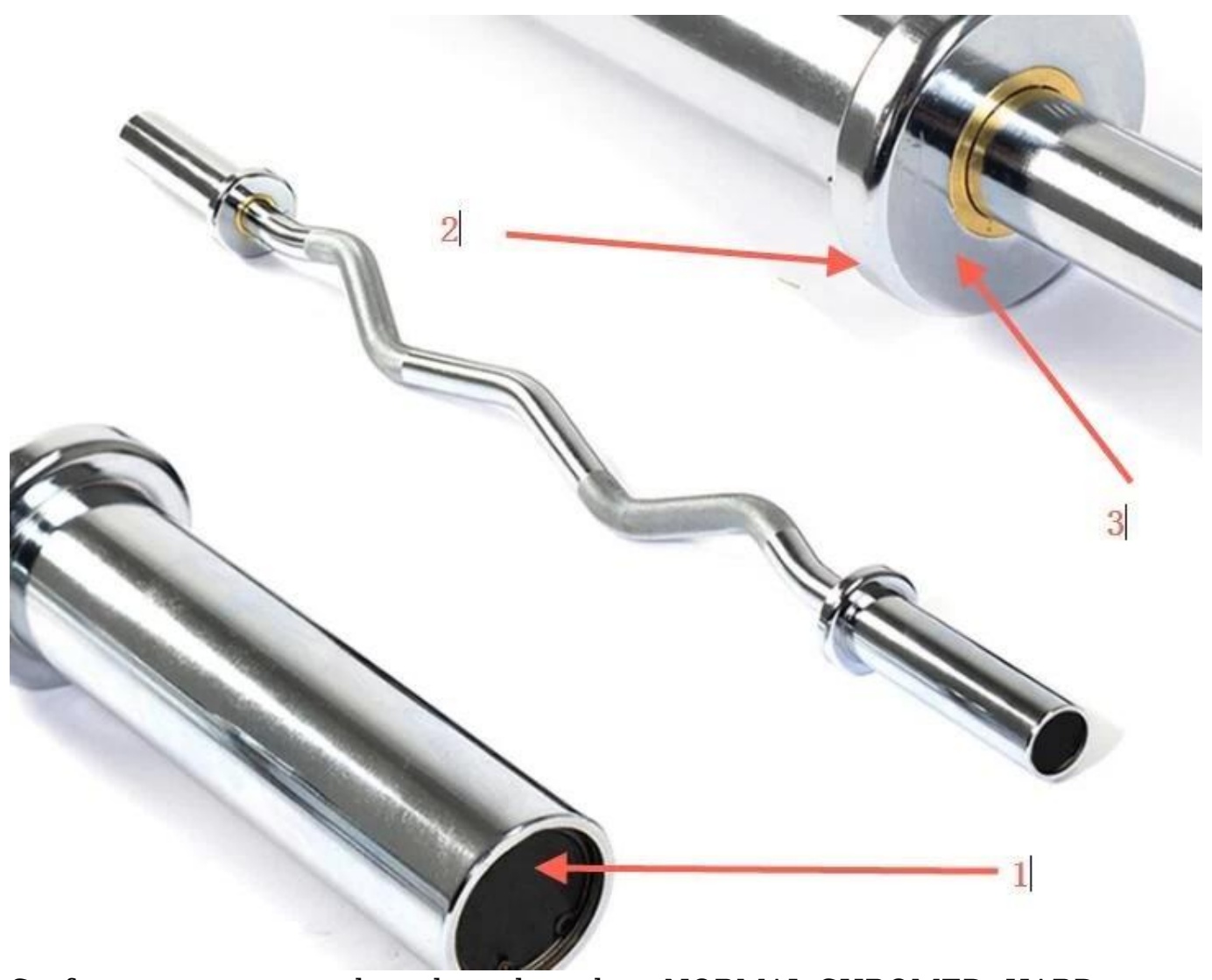
Surface treatment can be selected ,such as NORMAL CHROMED, HARD CHROMED,BLACK ZINC,CERAKOTE COATING.