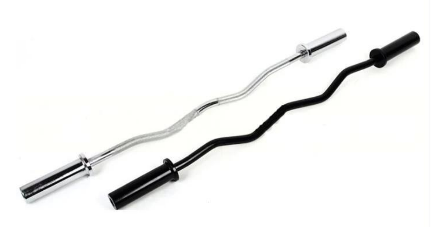
Pattern style can be customized