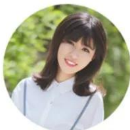
SHANDONG XINGYA SPORTS FITNESS INC.