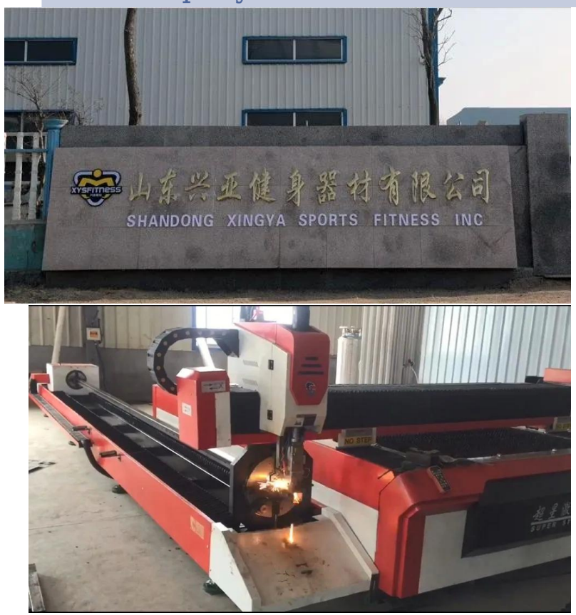
Factory Our Factory Machine