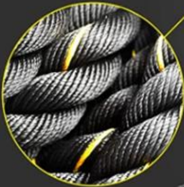
3-strand Twisted Polyester