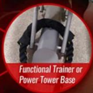
Functional Trainer or Power Tower Base