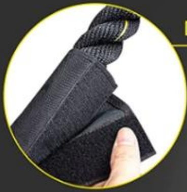
Detachable Protective Sleeve with Velcro