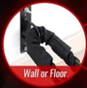
Wall or Floor