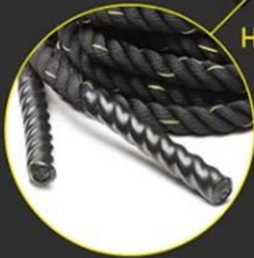
Heat Shrink Grips