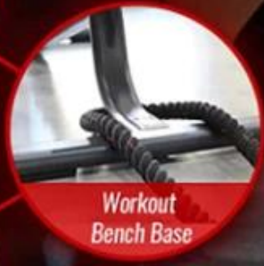
Workout Bench Base