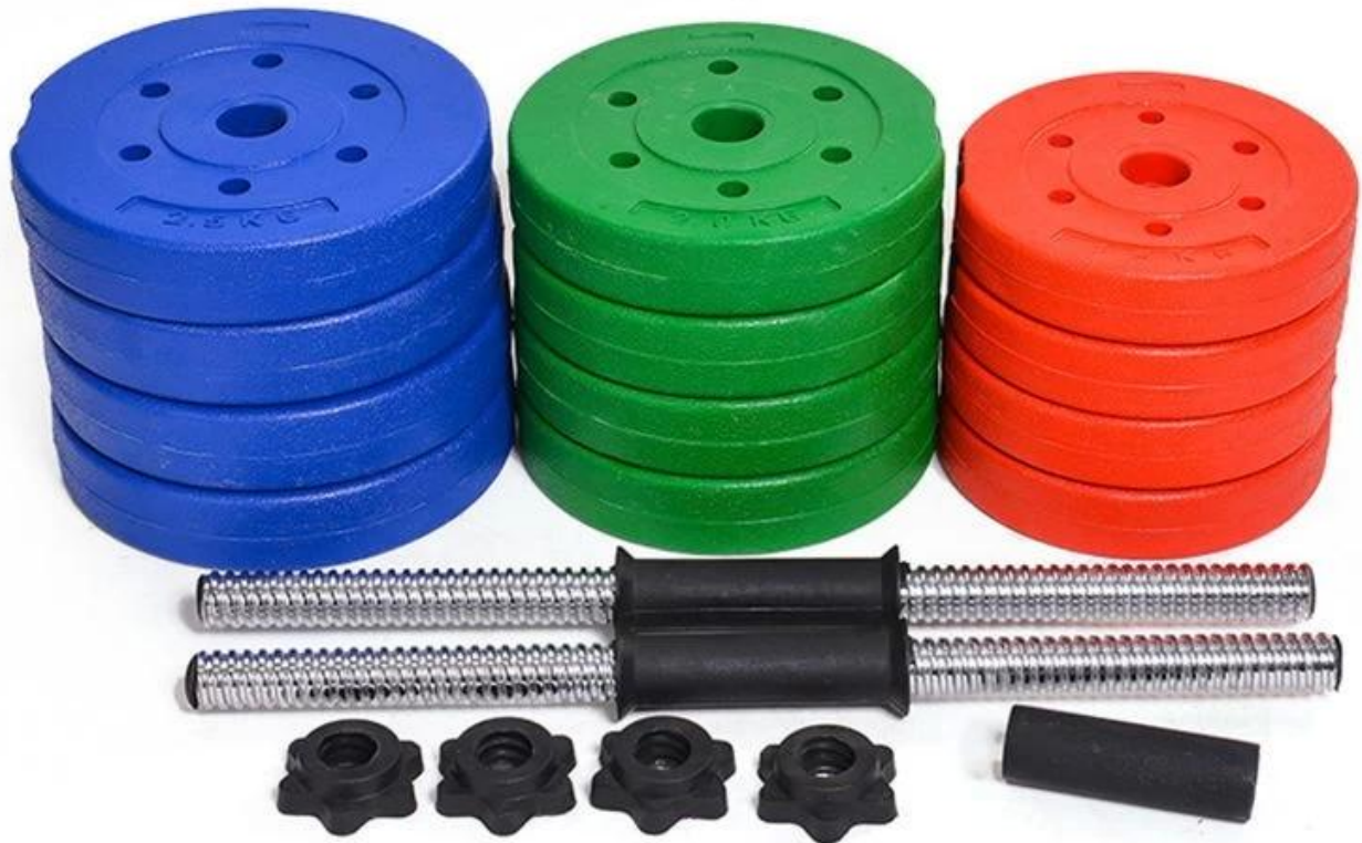
Dumbbell configuration Table

(The weight is one pair of cement dumbbell's weight )