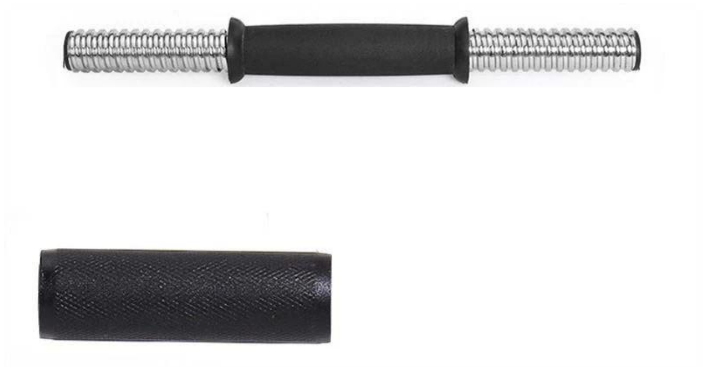
The non slip dumbbell handle