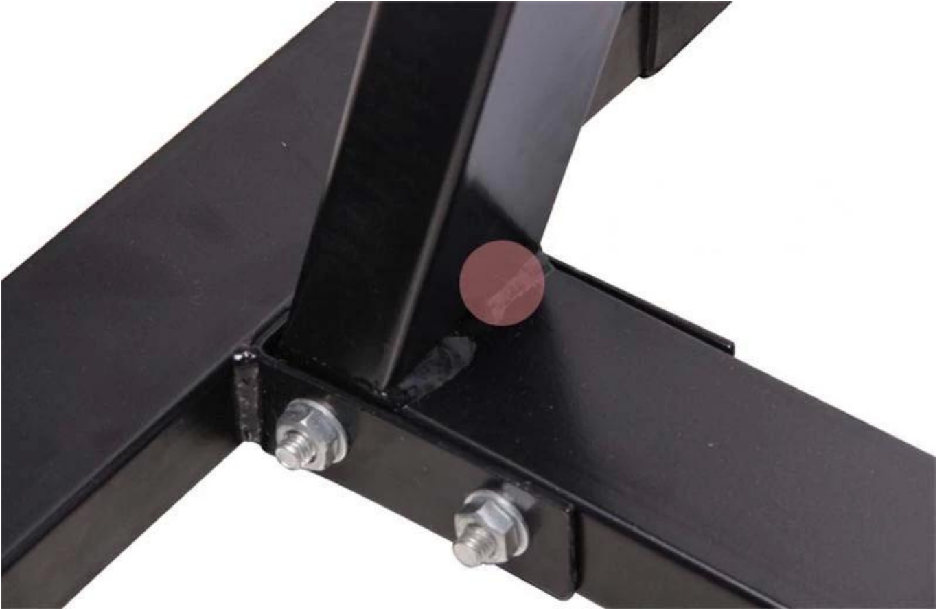
Triangle structure could stabilize this rack