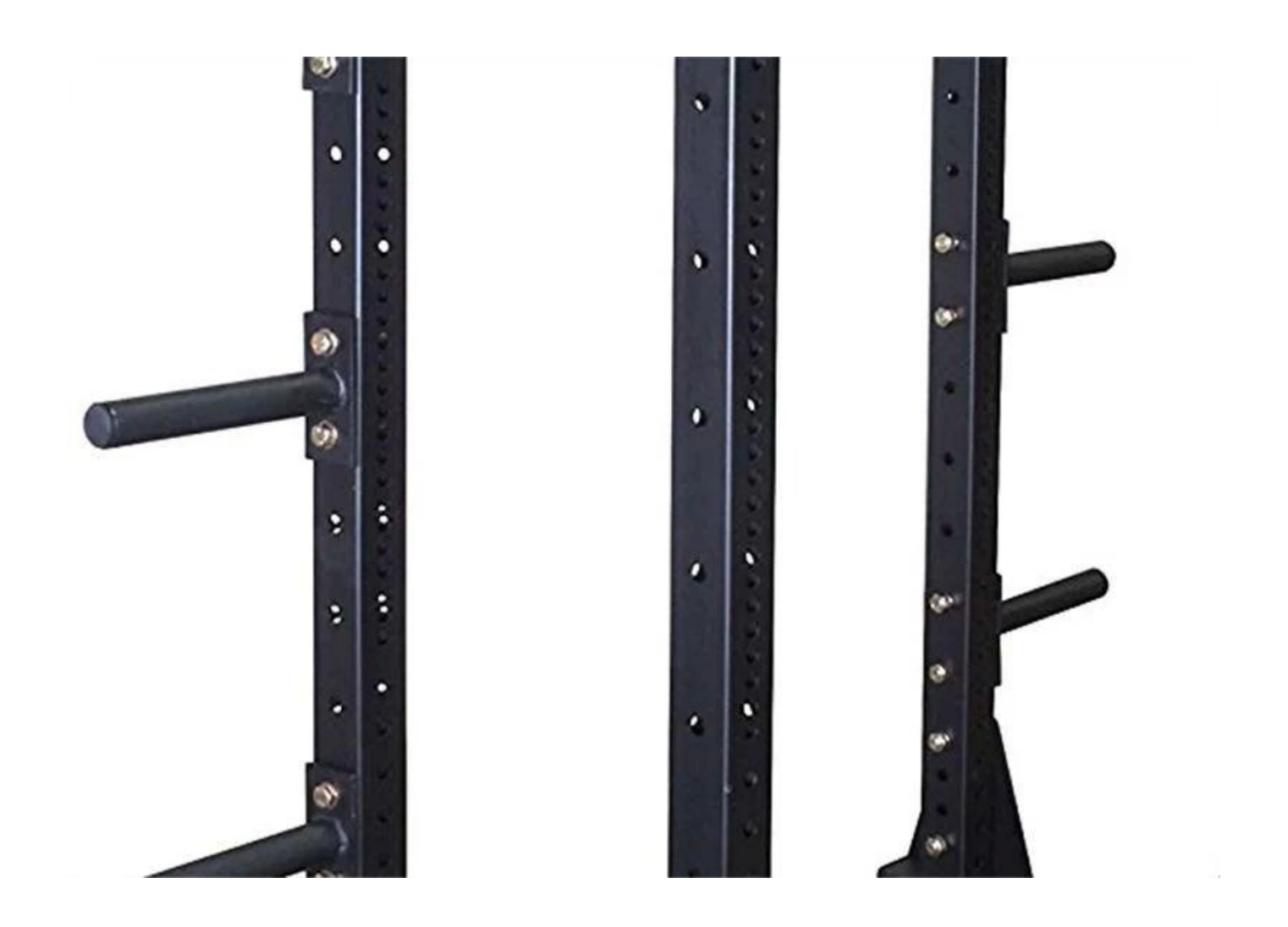
Screws on the upright column is very steady.