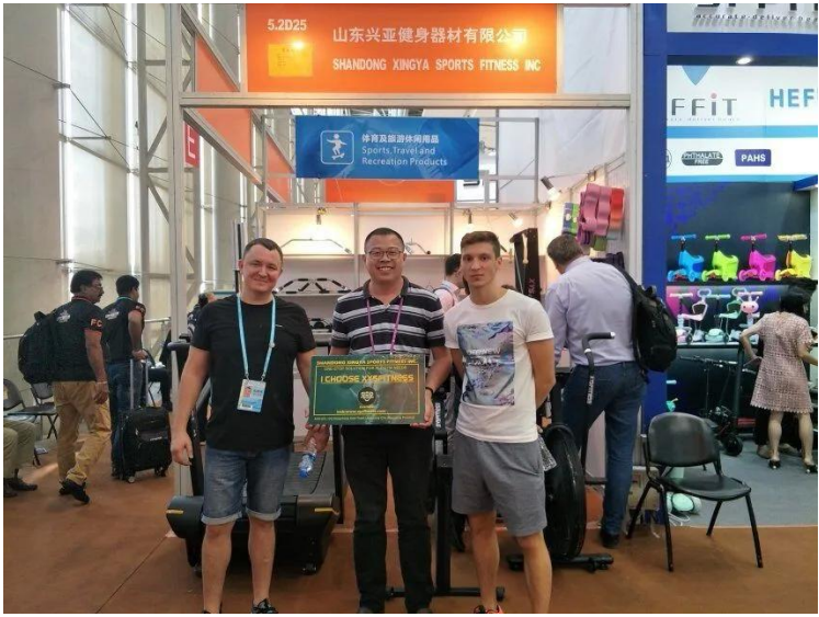
Favorable Comment 2.

We attended the 124th Canton Fair and the exhibition was very successful. So buyers.why not choose XYsfitness sporting. Choose us, Choose your best supplier.