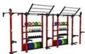
RIGS AND RACKS