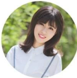
SHANDONG XINGYA SPORTS FITNESS INC.