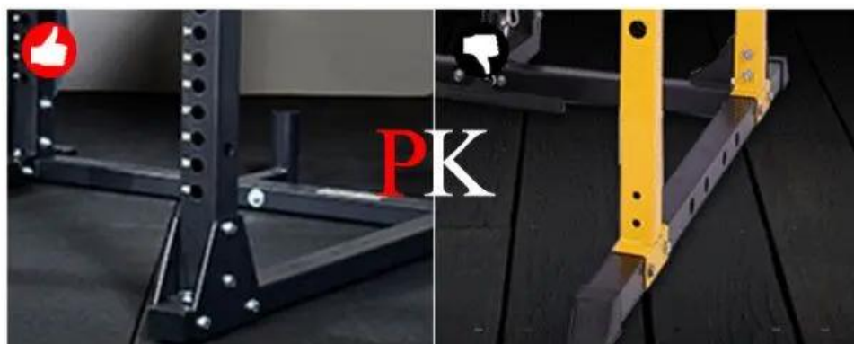
The triangle is fixed, and the structure is more stable and firm