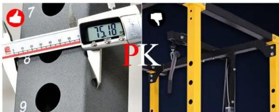
Column specification 80*80*3mm 75*75*3mm 65*65*2mm 60*60*2mm