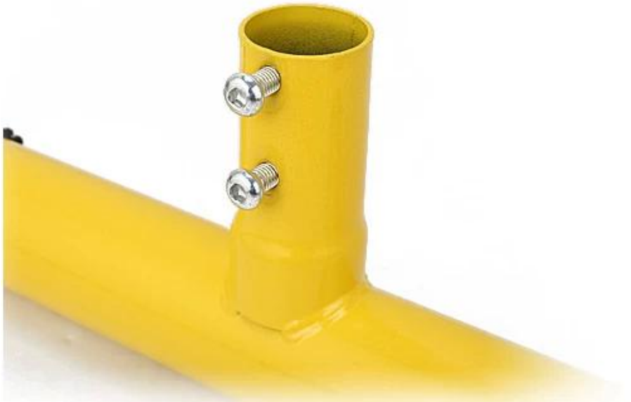
5,thickening steel tube