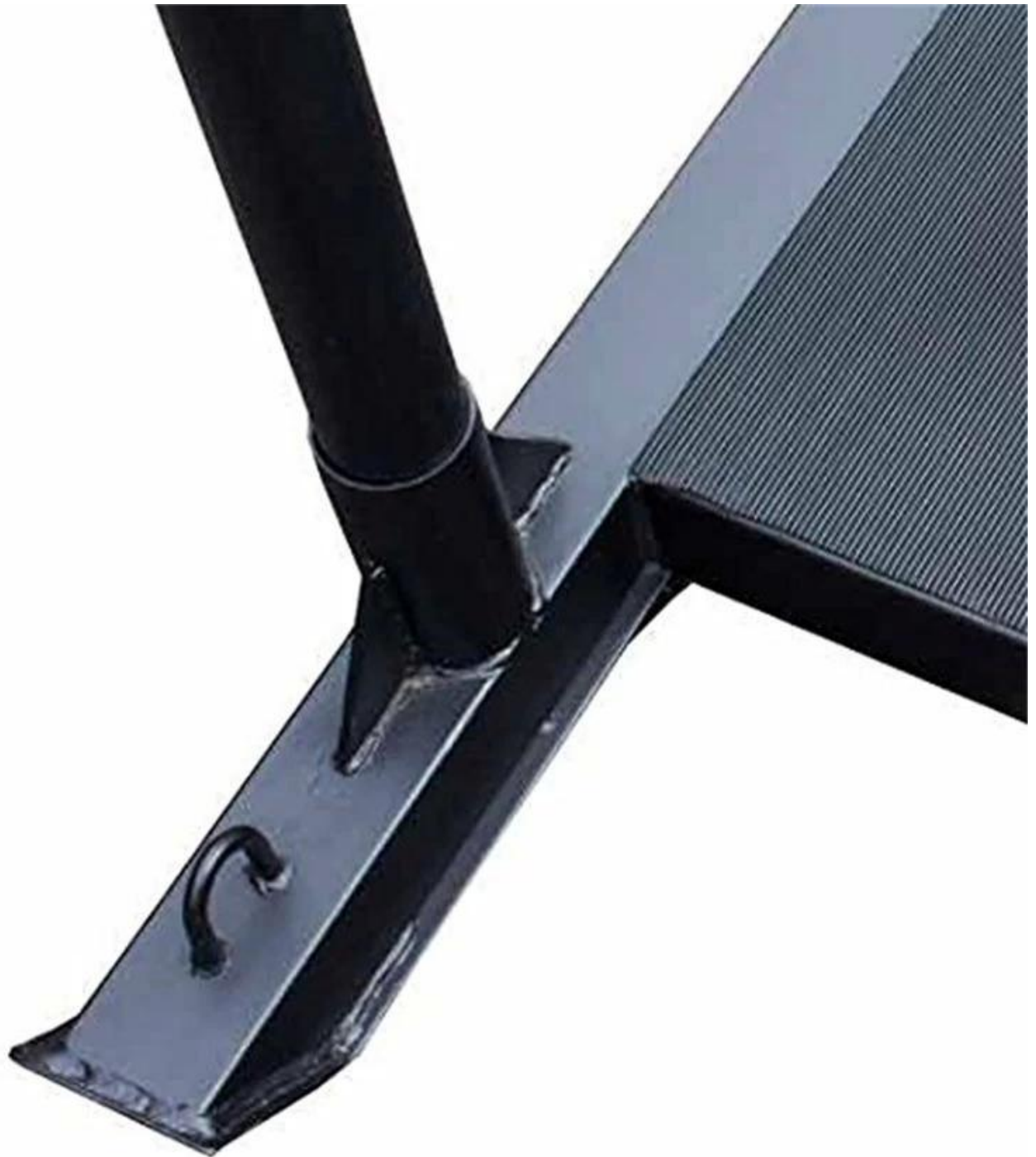
The hole on the sled skis