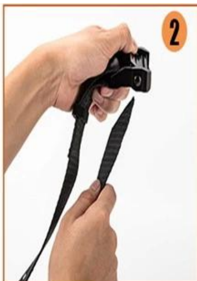
2. prepare the buckle and strap